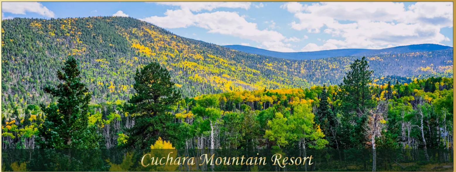
Cuchara Mountain Resort

Capture Colorado Mountain Properties, llc. CaptureColorado.com